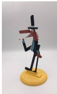
Fancy Fella Wood, acrylic, nails