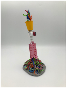
Virus Epoxy clay, wood, acrylic, LED light