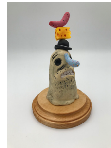
Sausage on Cheese on Ghost Epoxy clay, wood, acrylic