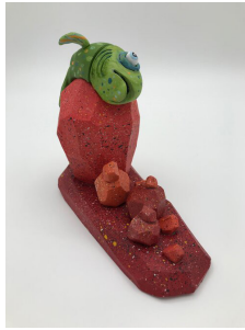
Fish on a Rock Epoxy clay, wood, acrylic