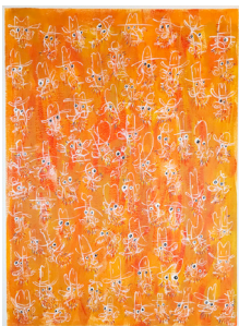
Ghost Town Pen, ink, gouache on water color