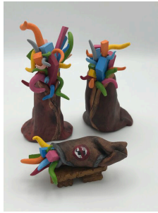
Nativity From the Dimension QxT032 Epoxy clay, acrylic