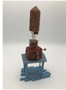
The Thing On The Table Epoxy clay, wood, acrylic, LED light