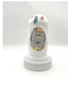
Mouths and Mouths and Mouths and Mouths Epoxy clay, wood, acrylic