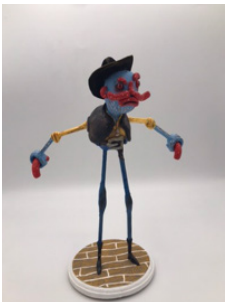
Sausage Face Stevens Epoxy clay, wood, acrylic