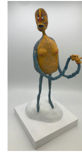
A New Parent Epoxy clay, acrylic, wood