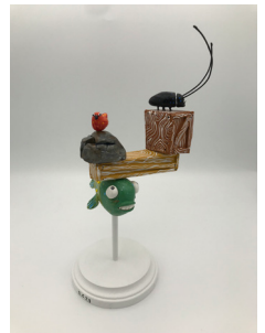
Bug on boxes and Bird on rocks on fish Epoxy clay, wood, acrylic