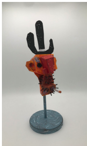
This Cowboy Wood, acrylic, nails