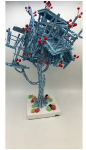
Chairy Tree Epoxy clay, acrylic, woo, Polymer clay