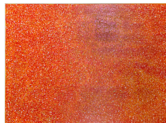
Make Room For These Please Pen, ink, gouache on water color