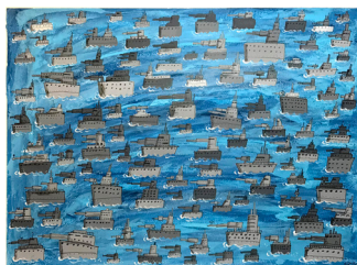
Armada! Pen, ink, gouache on water color