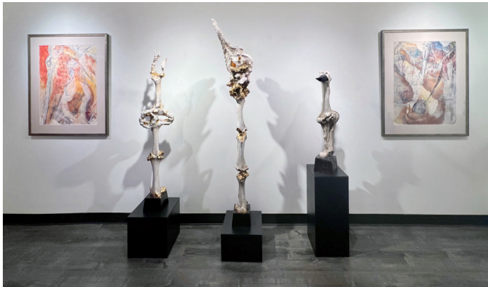
Daphne (sculpture-left) Bone and mixed media 2023 | 51"H x 8"W x 2"D $7,000