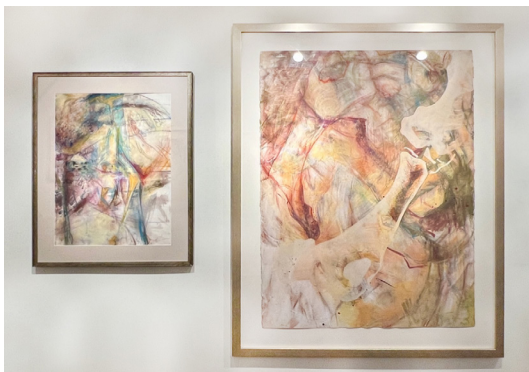
Birdhouse on Stilts Mixed medium on watercolor paper 2018 37 3/4"H x 30 1/2"W framed $2,500