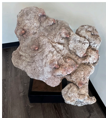
Matriarch Artifact Cement, polymers, steel 2018 | 26"H x 30"W x 40"D $7,000