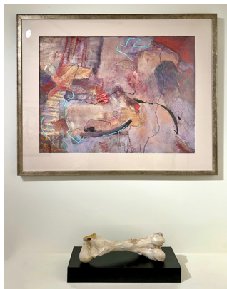
Parthenon Mixed medium on watercolor paper | 2023 30 1/2"H x 37 3/4"W, framed | $2,500