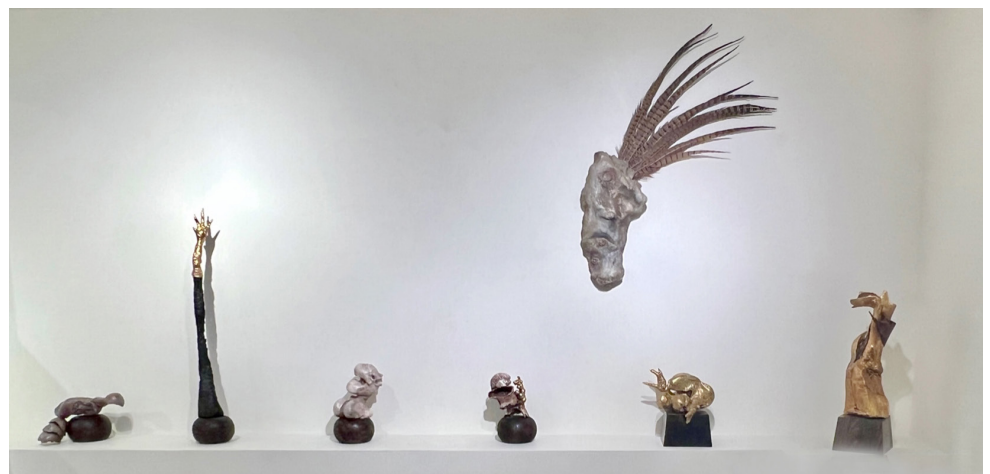
(from the left) Polypus, Phoenix, Venus, Oracle, Cancer 69, Nike Bone and mixed media | 2018 - 2023 Size varies | $2,500 each