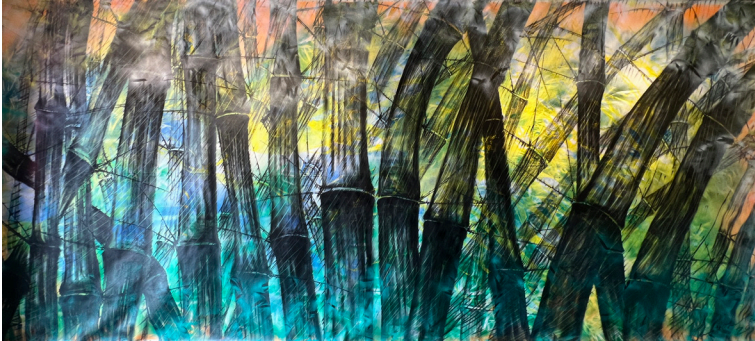
Bamboo Forest 3 2022 | 86" H x 188" W Mixed Medium on Canvas