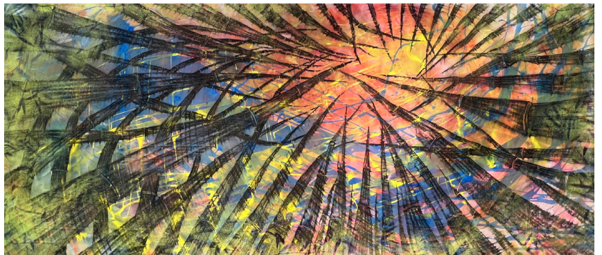
Bamboo Forest 1 2022 | 53" H x 124" W Mixed Medium on Canvas