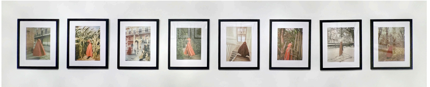
(from left to right) Little Red (NOLA/sidewalk) 2018 Little Red (cornfield) 2017 Little Red (NOLA/reflections) 2018 Little Red (Hampton Court/maze) 2017