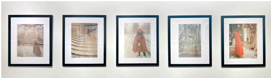
Little Red (Hudson) 2016