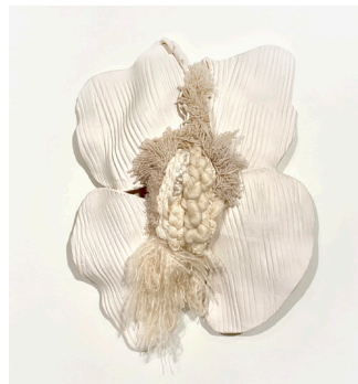
WILDWOOD FLOWER 2006 | 19" H x 14" W x 3" D Ceramic with mixed fiber weaving