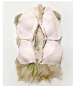
MYRTLE SO BRIGHT 2006 | 19.5" H x 14.5" W x 3" D Unglazed ceramic with mixed fibers weaving