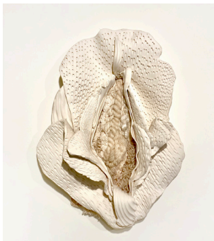
MISS MOLLY 2006 | 20" H x 16" W x 4.5" D unglazed ceramic, cotton, and wool weaving