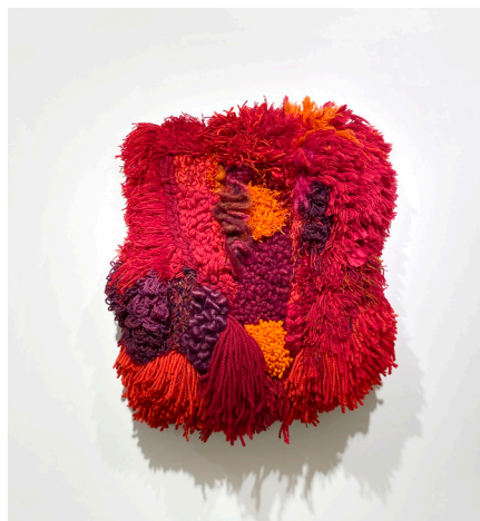
Hearts-a-Bustin' With Love (variant) 2021 | 26" H x 26" W x 7" D Weaving, mixed fibers