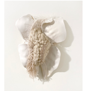
LITTLE MAGGIE 2006 10.5" H x 8.5" W x 2.5" D Ceramic with terra sigillata glaze, weaving with mixed fibers and coiling (basketry)