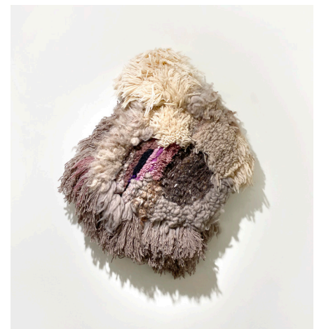
EVELYN (for my mother) 2019 | 38" H x 34" W x 7" D Weaving, mixed fibers