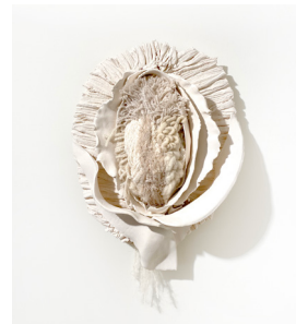
WHITE DOVE, lichen 2006 16" H x 14" W x 2" D unglazed ceramic with mixed fiber weaving