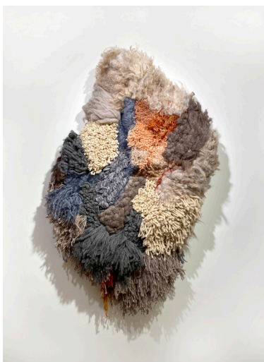
LILITH 2019 | 44" H x 32" W x 7" D Weaving, cotton, wool, and other fibers