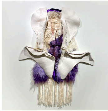
HANDSOME MOLLY 2006 | 46" H x 43" W x 4" D Ceramic and weaving with cotton, wool & other fibers with appliqué. In 5 pieces