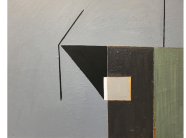
House of Night & Day