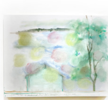
Pre du Port