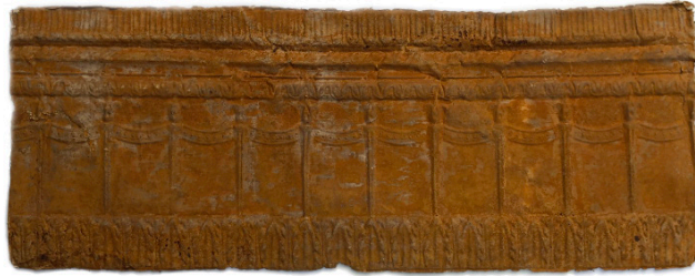
Memento No. 1 62 1/4" W x 24" H Paper pulp casting from PS1 classroom tin ceiling