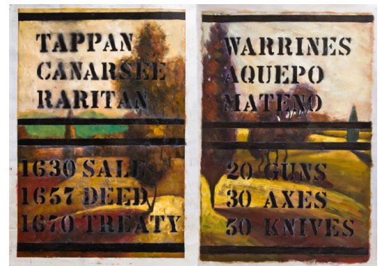
Stolen Land (Conquest of Paradise)

34 3/4" W x 25 1/4" H Schwartz Chemical Factory, Long Island City, NY Color print