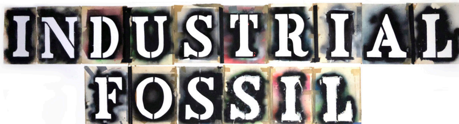
Industrial Fossil 108" W x 29" H | Stencil template