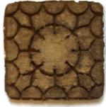
Memento No. 52 8" W x 8" H Paper pulp casting from PS1 metal grating