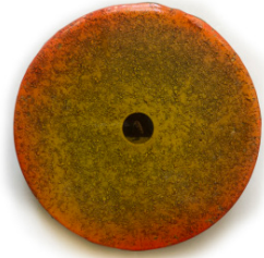
The Last Tree

4 3/4" Diameter x 1" D Spray paint, mixed media and resin on CDs