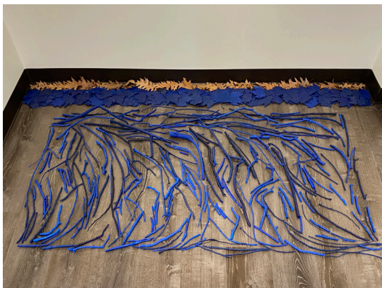
ZERO: Consciousness Unconscious 2021 | Mixed Media installation