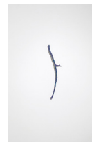
Walk | 2021 Mixed Media installation