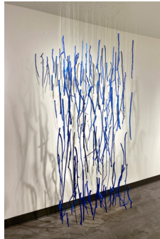
ZERO: Deep Ocean (Central Park) 2021 | Mixed Media installation