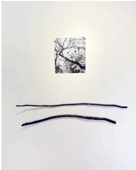
Meaning | 2015 9.17" H x 8.07" W Photography