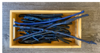
Wax Twigs 2021 | Mixed Media $10 each (Donation to the gallery)