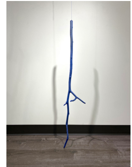
ZERO: Borrow | 2021 Mixed Media installation