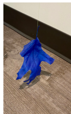
Seek | 2021 Mixed Media installation